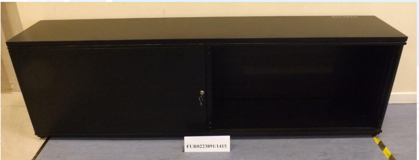
Front view of 'Test Product 4'

The 'Test Product 4' submitted for testing by Bisley Office Furniture, has satisfied the relevant requirements of BS EN 14074:2004 – Office furniture – Tables and desks and storage furniture – Test methods for the determination of strength and durability of moving parts.