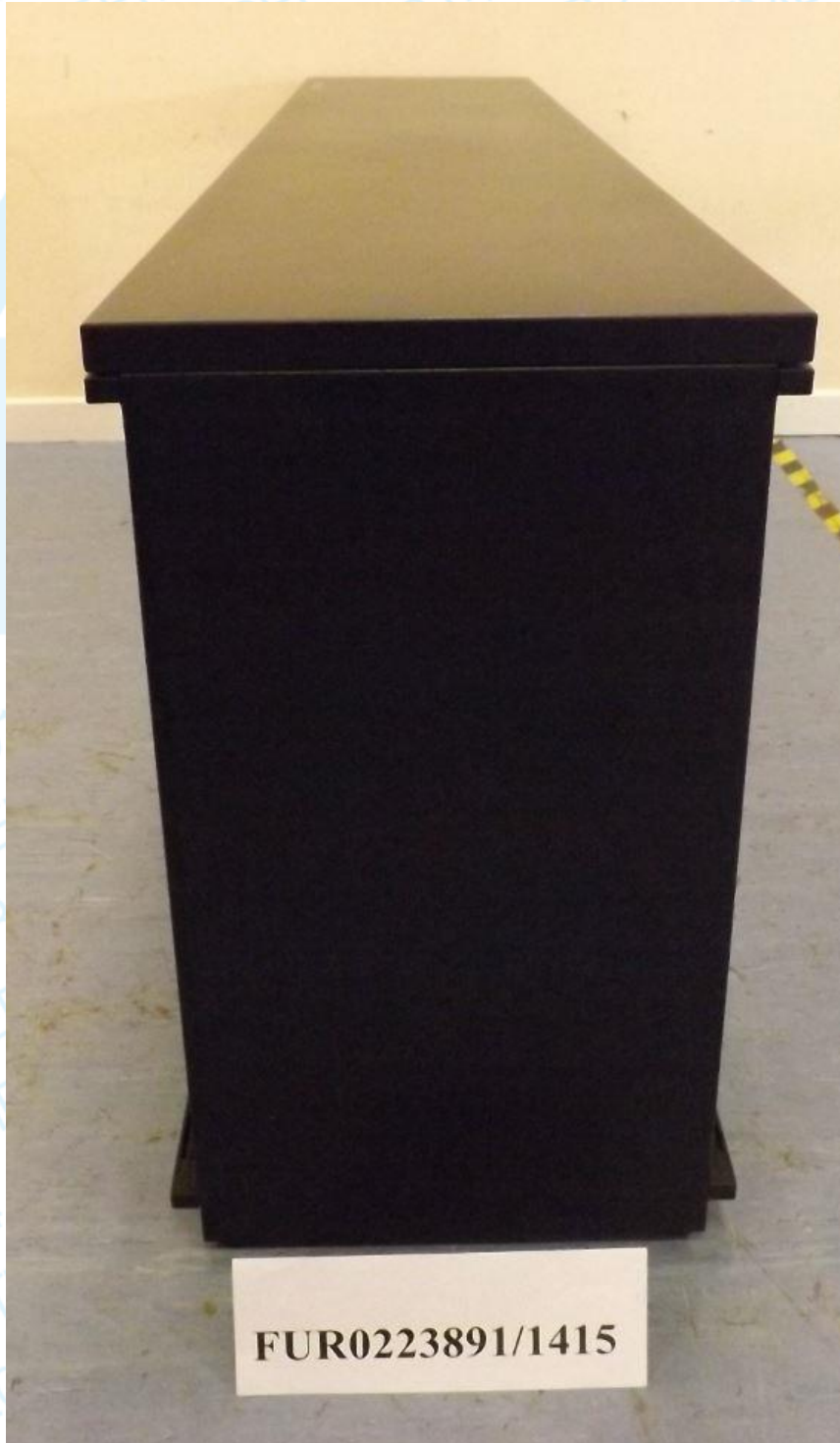
Side view of 'Test Product 4'