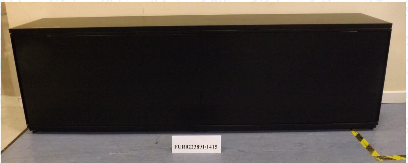
Rear view of 'Test Product 4'