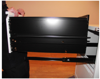
And clear of the unit the unit.