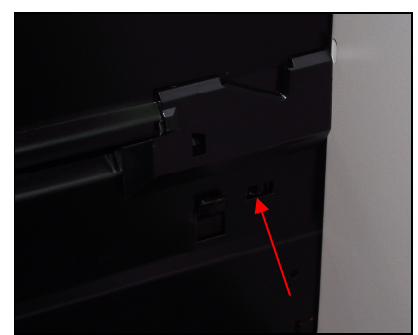
And also a retaining 'pip' at the front (this prevents the drawer coming off of the runners accidentally)

Look inside and take note of how the runners are fitted to the drawer, there is a front and rear tag lancing on each side.