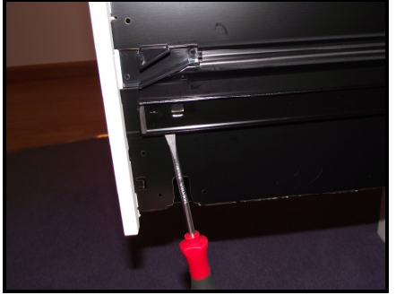
Insert a flat head screwdriver underneath the front of the runner as shown. You could also insert from the top whichever you find easier.