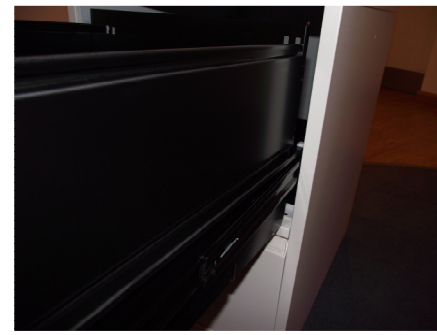
You can then pull the drawer towards you away from the rear lancings