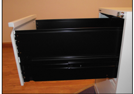
Fully extend the drawer.

Please ensure that the drawer is unloaded prior to removal