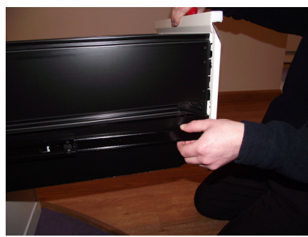
Repeat this on the opposite runner so that you have the drawer free of both front lancings. (Support the weight of the drawer)