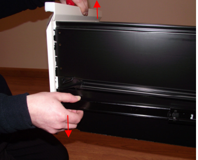
The drawer is then free to be lifted upwards off the front tag lancing