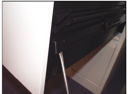
You need to lever the runner member away from the drawer body as shown thus negating the retaining pip.