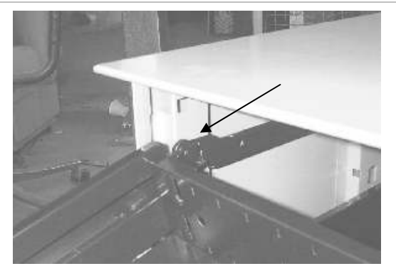
The motion requires the slide wheel attached to the drawer, to rise over the slide wheel attached to the cabinet.