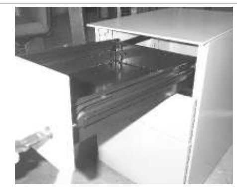
Unload the drawer and extend fully. Hold the drawer underneath the front and raise, as you pull the drawer away from the cabinet.