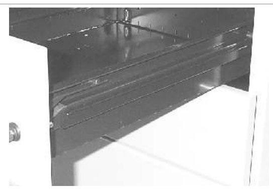
Pedestal stationery drawer fitted with a Fulterer suspension slide.