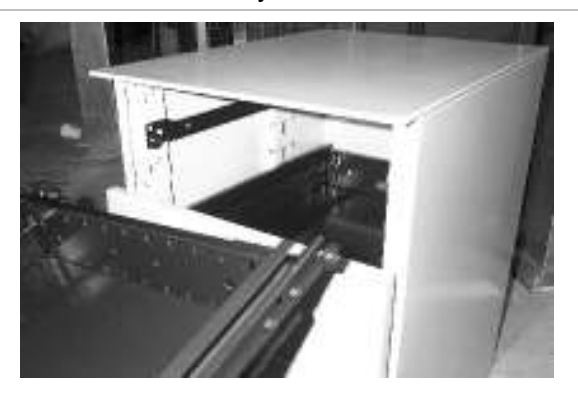
Pull the drawer away from the cabinet. (Take care to support the weight of the drawer)